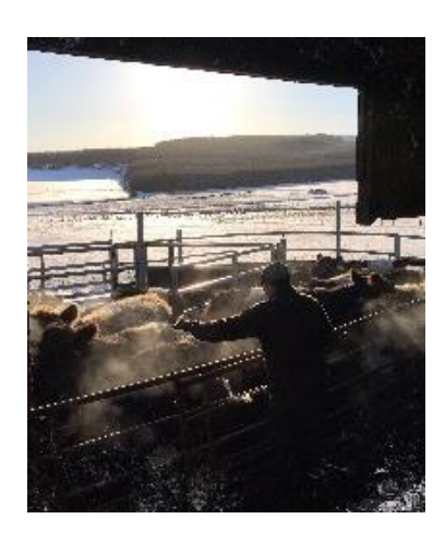
Lot 5 Butchery Course, Wark Farm

Day course includes: Cooking demonstration - slow cooking, full butchery demonstration - complete breakdown of a lamb carcass, butchery practical - boning and rolling a lamb shoulder, farm walk - explanation of land and animal care, grazing systems and conservation. Take home a rolled joint as well as a butcher and meat cookery information pack.